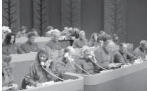
ASSE and OR-OSHA staff the phones and advertise the GOSH Conference at the OPB Pledge Drive